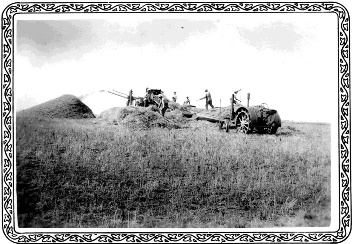
Hired hands from Missouri stacking grain (oat or barley). 1937 John Deere D tractor. From the condition of wheat, this was a drought year in the 1930s.