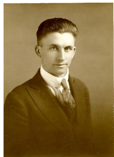
1916 Taken when teaching at Greeley, Kansas.