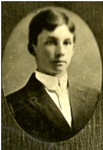
1913 H.S. Graduation