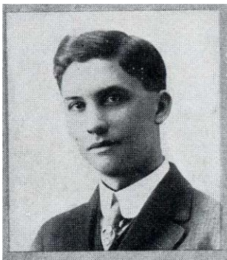
1915 Kansas State Normal College Delphian: Mathematics Club, Physics Club, Commencement Play '15